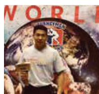
Bat-erdene Byambasuren of Mongolia, World Bronze Medalist